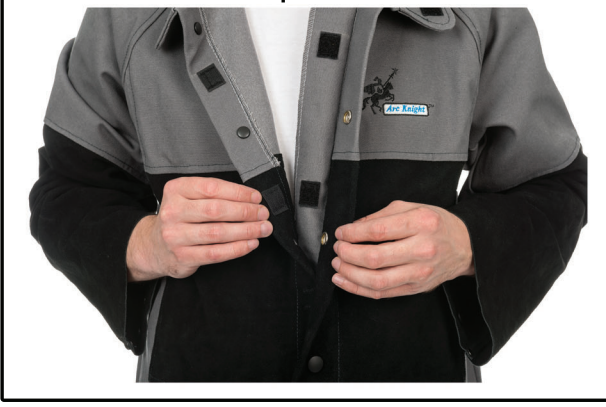
Adjustable Roll-Up Collar