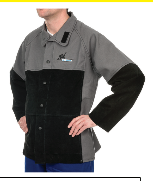
Interior Spatter Guard